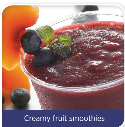
Creamy fruit smoothies